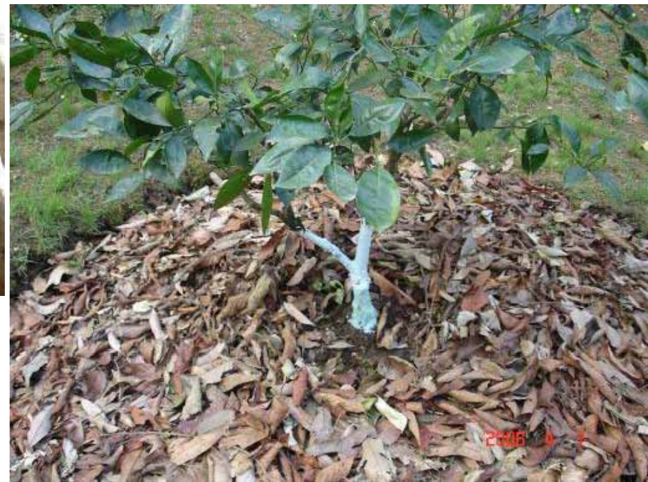
Mulching fruit tree (citrus) for better moisture conservation