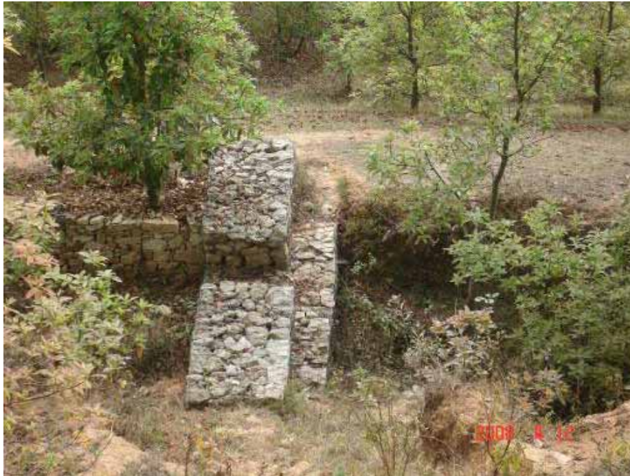
Gully plugging using a gabion check dam