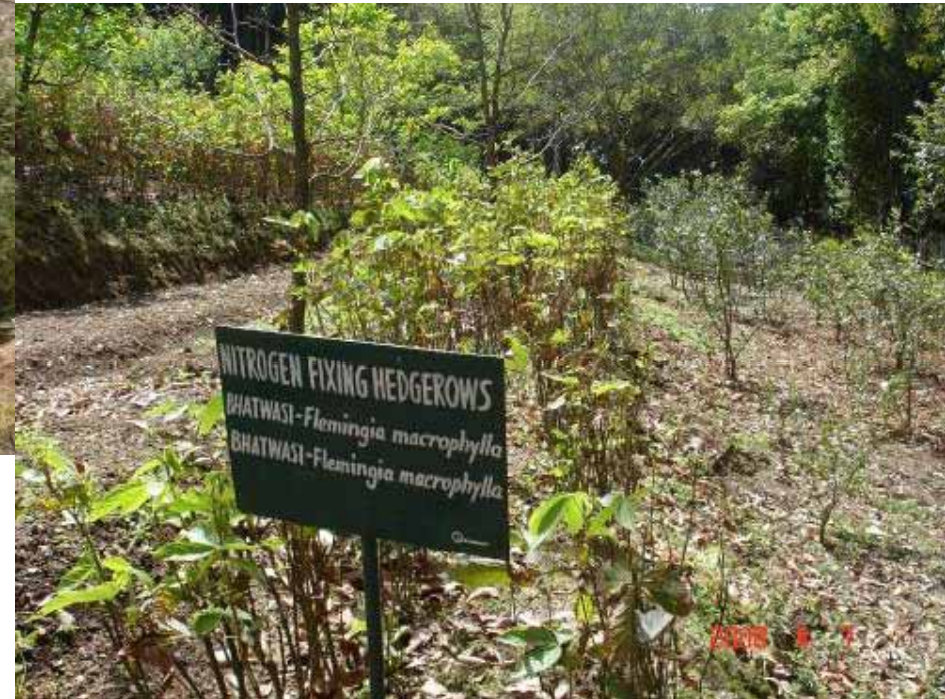
Double-row hedgerow across sloping agricultural land to reduce soil erosion and fertility loss