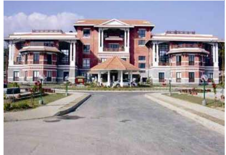
ICIMOD HQ at Lalitpur, Kathmandu