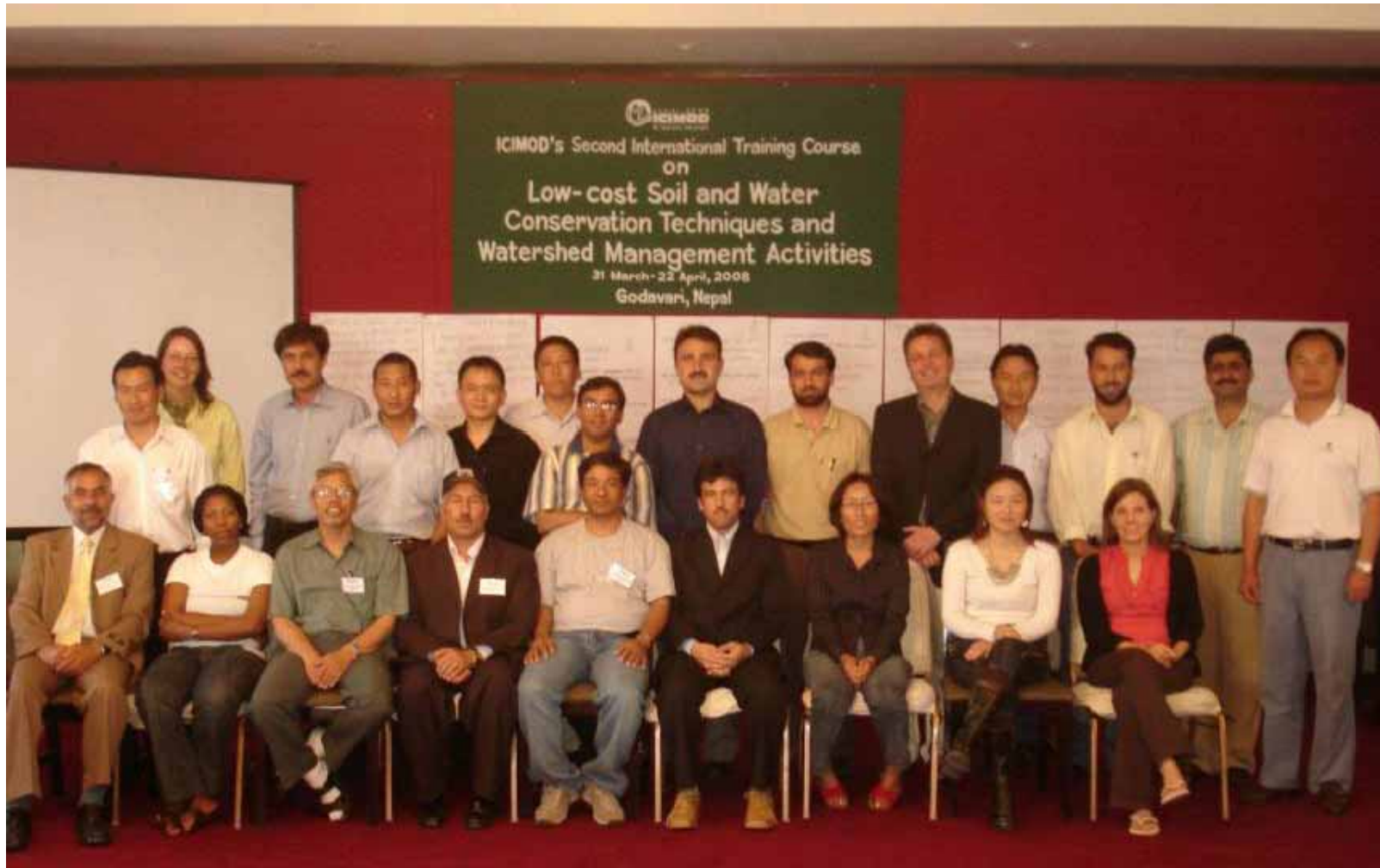
Participants and ICIMOD staff at the closing session