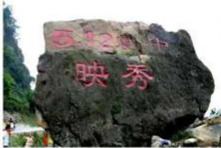
5.12 Wenchuan Earthquake Site

A 1-day pre-conference field trip is planned to visit Dujiangyan and the 5.12 Wenchuan Earthquake Site—Yingxiu. Dujiangyan is one of the World Cultural Heritage sites in central Sichuan Province, where visitors can observe a gravity irrigation system built in 250 B.C., which has made the Chengdu Plain a "Land of Abundance" with bumper crops every year irrespective of droughts or floods.