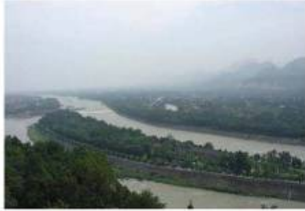
Dujiangyan Irrigation Project