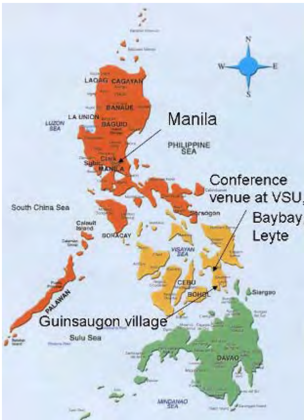
Map of the Philippine Islands