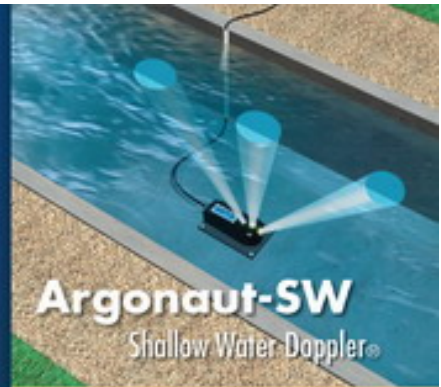
Argonaut-SW Shallow Water Doppler®