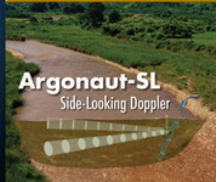
Argonaut-SL Side-Looking Doppler