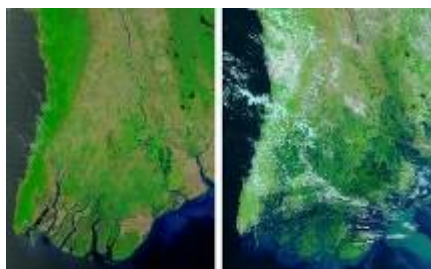
Irrawaddy delta of Myanmar on April 15 and May 5, 2008

"There are other NGOs here - Metta Foundation, IDE, Hope International, etc who will work in the Delta region. We can only take care of what we know. If any of you have ideas for fundraising - can you contact rookezobrist@hotmail.com or check the Foundation for the People of Burma website www.foundationburma.org – they have a link with a pay pal type thing for donations. Thank you so much for your support."