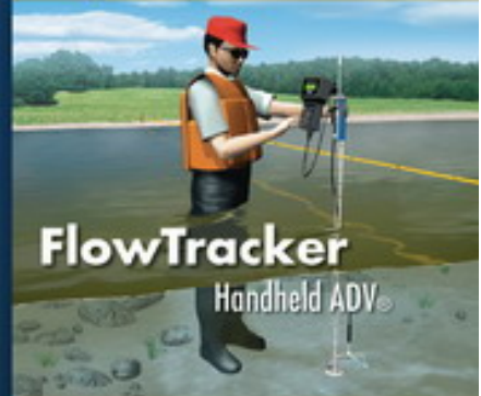
FlowTracker Handheld ADV®